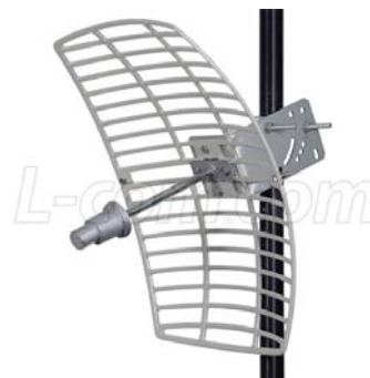
Tilt &amp; Swivel Mast Mount