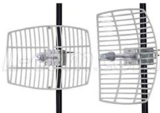
Vertical or Horizontal Polarization

This antenna is supplied with a 60 degree tilt and swivel mast mount kit. This allows installation at various degrees of incline for easy alignment. They can be adjusted up or down from 0° to 60°.