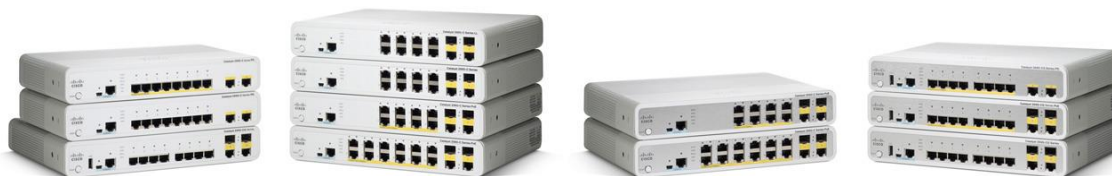
Cisco Catalyst 2960-C Series Compact Switches