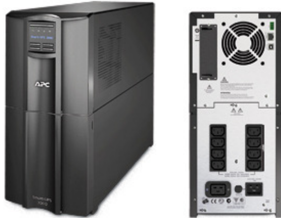
APC Smart-UPS 3000VA LCD 230V Part Number: SMT3000I

Technical Specifications Product Overview Documentation Software & Firmware Options Ratings and Reviews