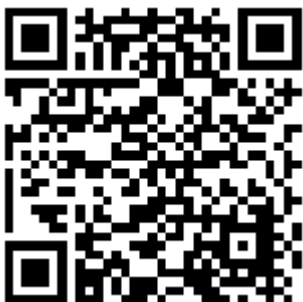
SCAN QR FOR PRODUCT PAGE

This part number has created a 5 metre SC OS1/OS2 pack of 12 pigtails in different colours.